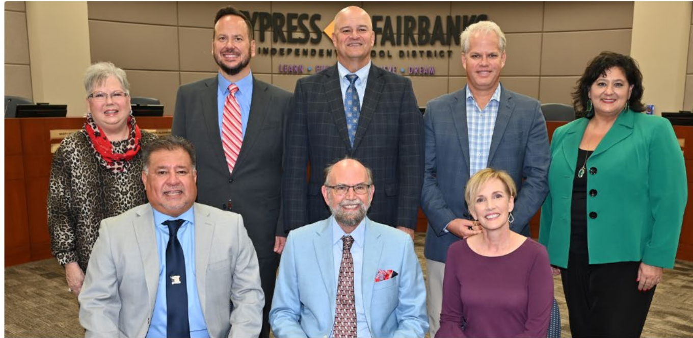
Board of Trustees